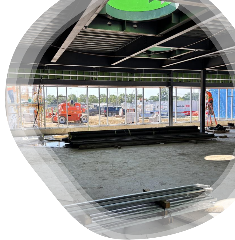
Lobby and Front Windows Facing South